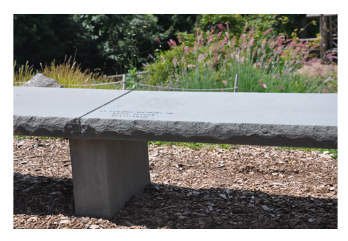
Each individual stone bench becomes part of an unbroken row of benches

A $15,000 contribution will underwrite the purchase of a rustic stone bench at the base of the Temple of Love. Your dedication will be etched onto the seat. The stone bench is guaranteed for a period of 50 years and will be replaced if it is severely damaged within that time period.